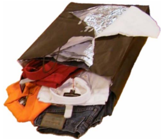
The classic boosterbag